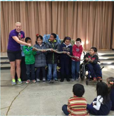
Students learning about snakes at the Australian Animals Assembly.