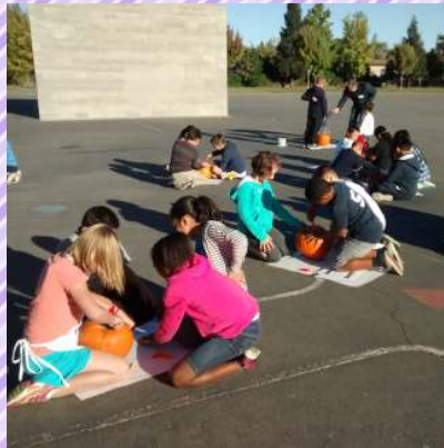
More 4th graders working on their pumpkins,