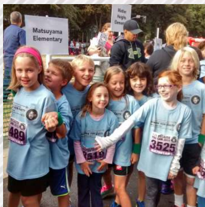
More Matsuyama BOKS running club members ready to run the 5K race.