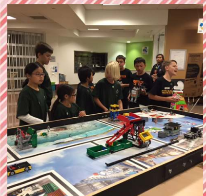
Matsuyama's Robotics Team at their 1st Lego League Competition.